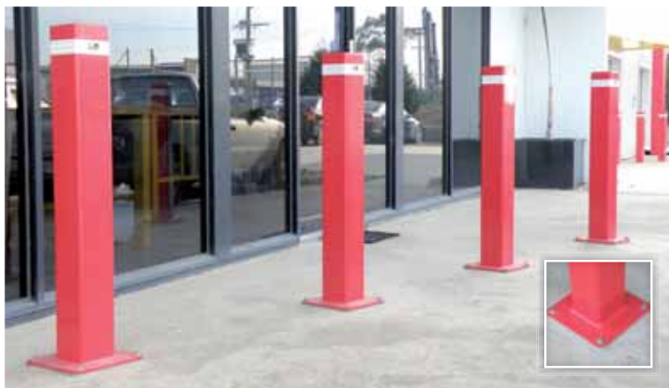
CS150SM Bollards shown.

Our fixed surface mount bollards are designed for traffic control situations or property and asset protection. Manufactured from heavy wall mild steel tube with fully welded base plates, these bollards are able to take the hard knocks. Suitable for installation onto any concrete surface. Available in round or square designs. All our bollards are supplied complete with necessary fixings and are available in a hot dip galvanised finish or hot dip galvanised with a powder coat finish.