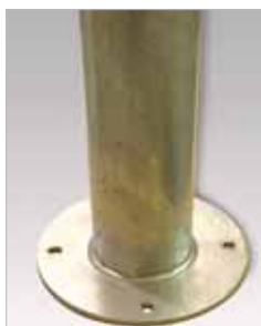
Surface mount flange.