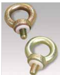
Optional chain rings (FIX1117).

Optional chain rings are available for connecting chains or ropes to our bollards. Simply order with chain rings. Chain rings can also be purchased separately for retro fitting to existing bollards by drilling and tapping M10 threads as required.