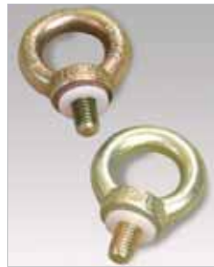
Optional chain rings (FIX1117).

Optional chain rings are available for connecting chains or ropes to our bollards. Simply order with chain rings. Chain rings can also be purchased separately for retro fitting to existing bollards by drilling and tapping M10 threads as required.