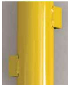
Welded anchoring bars.

Polyethylene protective sleeves are available to suit round C90 and C140 bollards. For more information see Section 1.1.