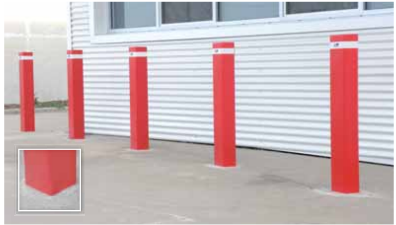
CS150BG Bollards shown.

Available in round or square designs. All our bollards are hot dip galvanised with the option of a powder coated finish.