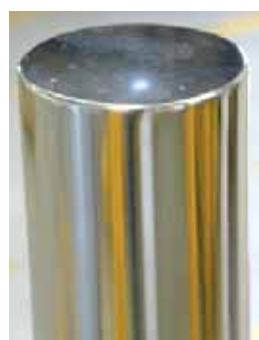
Welded and polished flat cap.