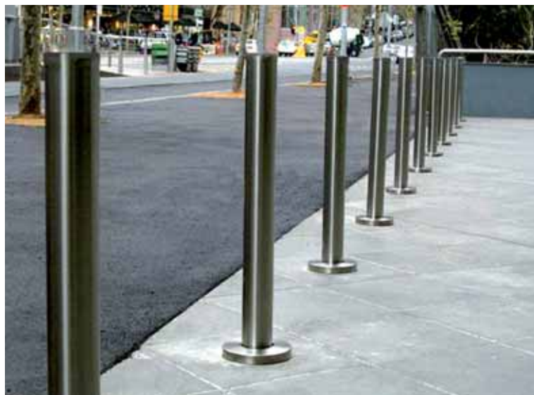
C90SM-SS10 with optional base cover COV90-SS.