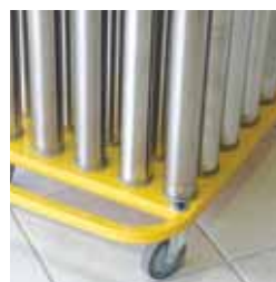
Optional 40 post storage and handling trolley.