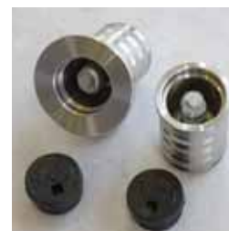
Carpeted sleeve and flush sleeve for tiled or concrete floors.