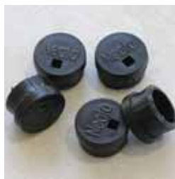
Additional sleeve cap.

NOTE: In-ground sleeves are ordered separately to posts.