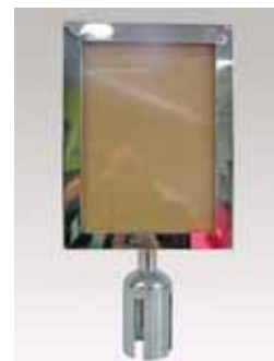
Neata sign holder fits all models.