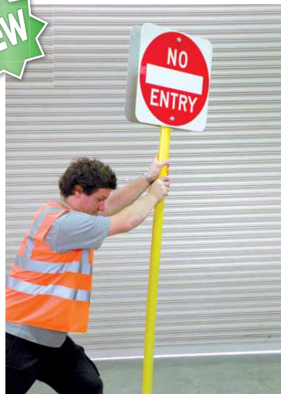
FRP flexible post.