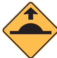
S1001-RA – Aluminium sign with class 1 reflective face 600 x 600mm.