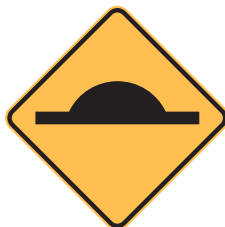
S1000-RA – Aluminium sign with class 1 reflective face 600 x 600mm.

While we are not pretending to be a sign company, we do carry a small range of signs which relate to specific products in our range. Our signs consist of Class 1 or Class 2 grade reflective sheeting pressure laminated to 2mm aluminium sheet and are pre-punched to accept mounting brackets.