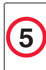
S1169-RA – Aluminium sign with class 1 reflective face 450 x 600mm.