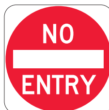
S1018-RA – Aluminium sign with class 1 reflective face 450 x 450mm.