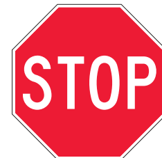
S1005-RA – Aluminium sign with class 1 reflective face 600 x 600mm.