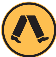
S1007-RA – Aluminium sign with class 1 reflective face 600 dia.

NEW Fibreglass reinforced plastic (FRP) posts offer amazing strength with a degree of flexibility. This is particularly useful if installing signs into environments where they are likely to be subjected to abuse or low speed impacts such as in car parks etc. Available in any length up to 5 metres. They are 50mm in diameter with a 5mm thick wall and solid high viz yellow colour.