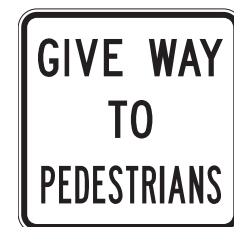
S1155-RA – Aluminium sign with class 1 reflective face 600 x 600mm.