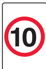
S1022-RA – Aluminium sign with class 1 reflective face 450 x 600mm.

Choose from four standard lengths of 60mm diameter sign posts plus sign mounting brackets, caps and surface mount flanges to complete your installation.