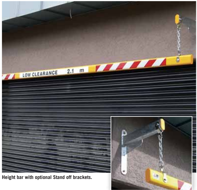
Height bar with optional Stand off brackets.