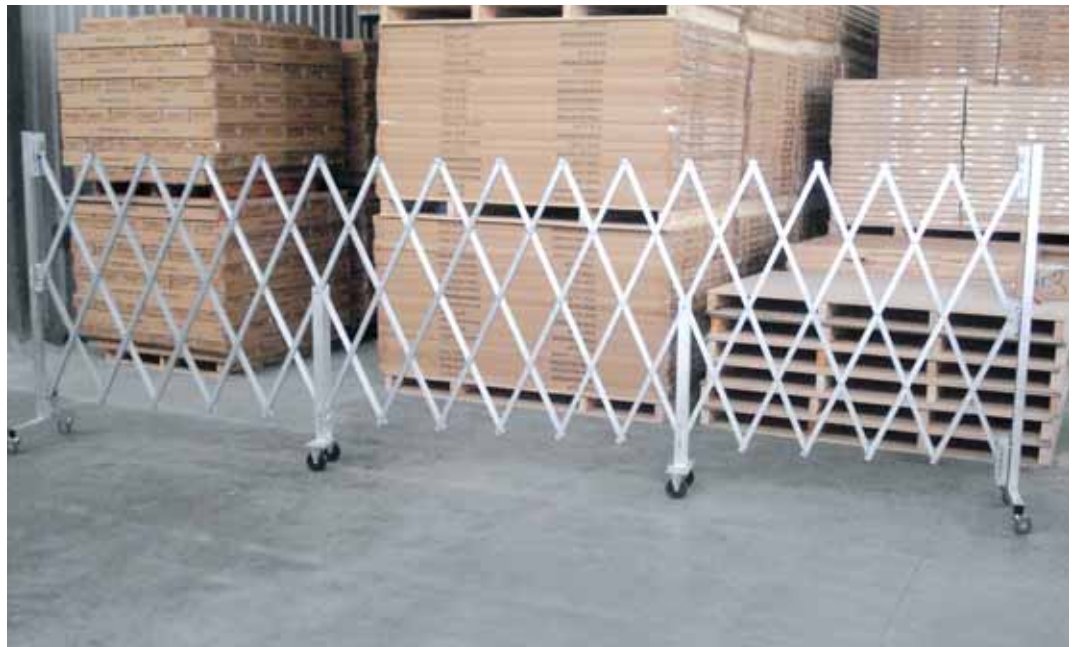
BPGM140 Port-a-guard Maxi.