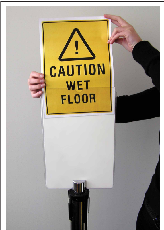
SPA4 – A4 SIGN POCKET

Clear polycarbonate sign pocket to receive A4 Laser print signs.