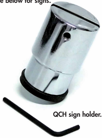
QCH sign holder.