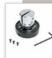
SH2 sign holder.