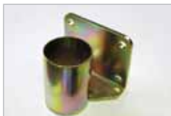
Wall mount bracket.