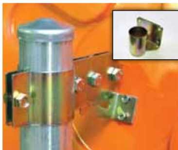
Post mount bracket & wall mount bracket (inset).