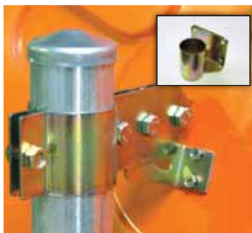
Post mount bracket & wall mount bracket (inset).