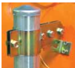
Post mount bracket.