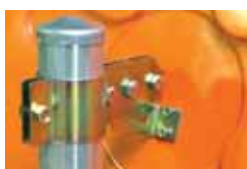
Post mount bracket.