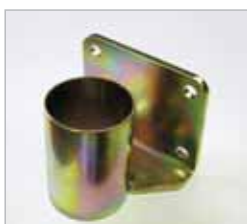
Wall mount bracket.