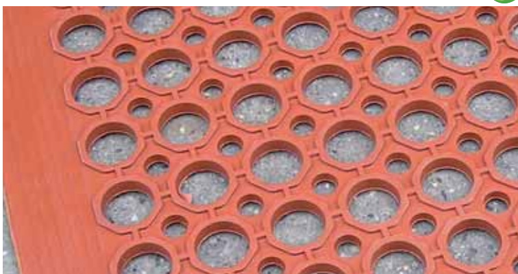
FM3660R – Oil resistant mat.

Measures 910 x 1520 x 10mm (this mat is coloured red to distinguish that it has oil resistant properties, compared against other normal mats in black).