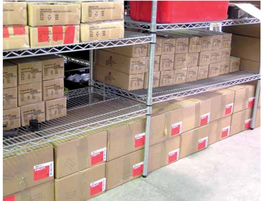
Heavy duty / High quality.