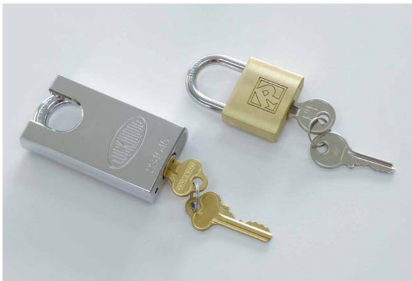
BPL2 and BPL1.