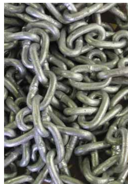
Galvanised steel chain.