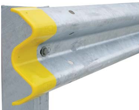
High visibility end boot (included) fits easily onto the W-Beam rail ends.

Installation: Surface mounted with fixings supplied.