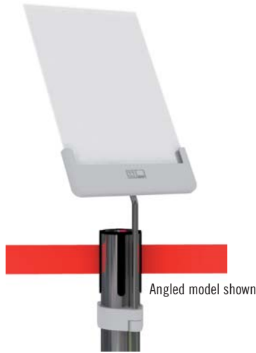
Angled model shown