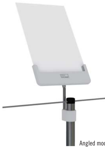
Angled model shown