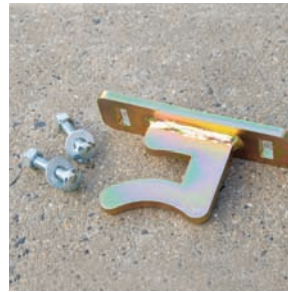
Heavy duty brackets for roller door model.