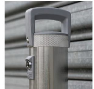
316 stainless steel with aluminium caps and handles.