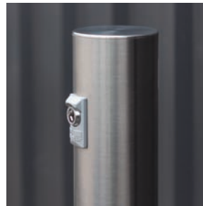
316 stainless steel with flat caps.