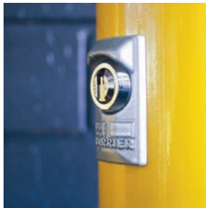
Top quality 'Bi-Lock' security locks.