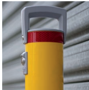
Gal. and powder coated with aluminium caps and handles.