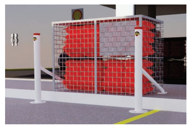
Linebacker BR bollards can be installed onto sloping or stepped ground levels.

Phone us or visit our website for more information!