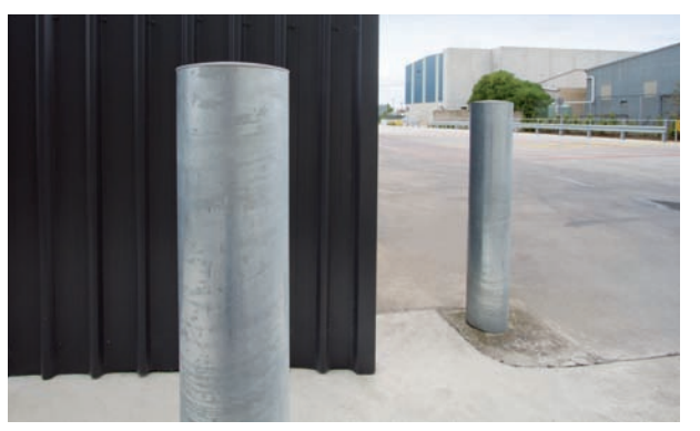
Below ground bollards have fully welded anchoring bars.