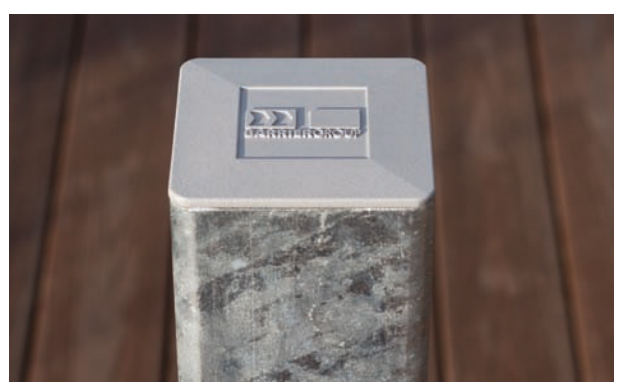
Cast aluminium knock-in caps on all square bollard models.