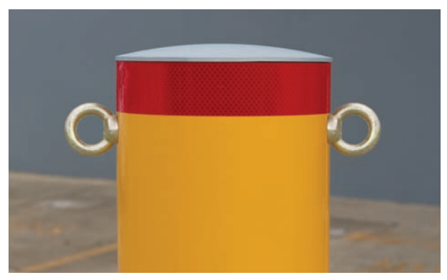
Cast aluminium cap with optional chain ring kit.