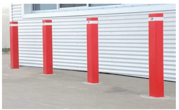
Below ground bollards have fully welded anchoring bars.