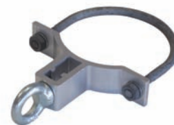
Optional wall or post mount receiver kit (padlock not included).