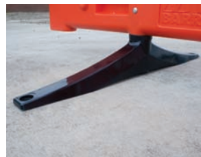
Rotating foot with fixing hole.