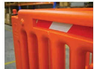
Reflective panels for high-visibility.