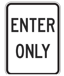
S1166-RA 450 x 600mm