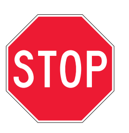
S1005-RA 600 x 600mm