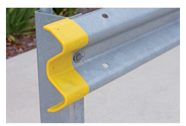
High visibility end boot (included) fits easily onto the W-Beam rail ends.