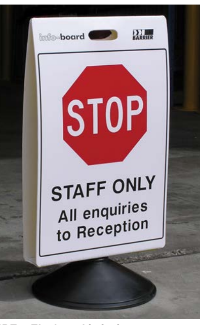
IB7 – 7kg base kit & sign.