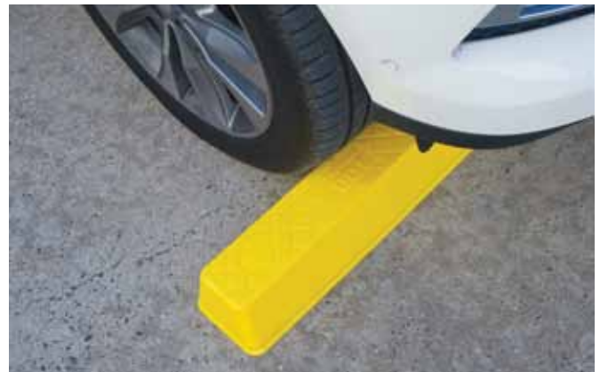
Blanking caps provide a flush finish while concealing fixings.