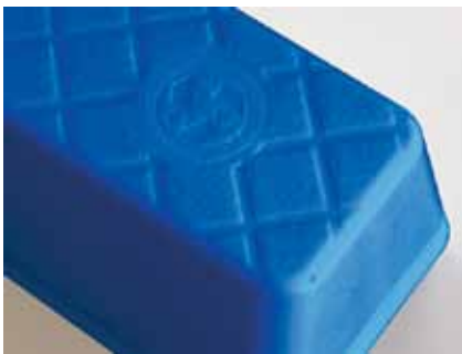
Blue for disabled parking spaces.