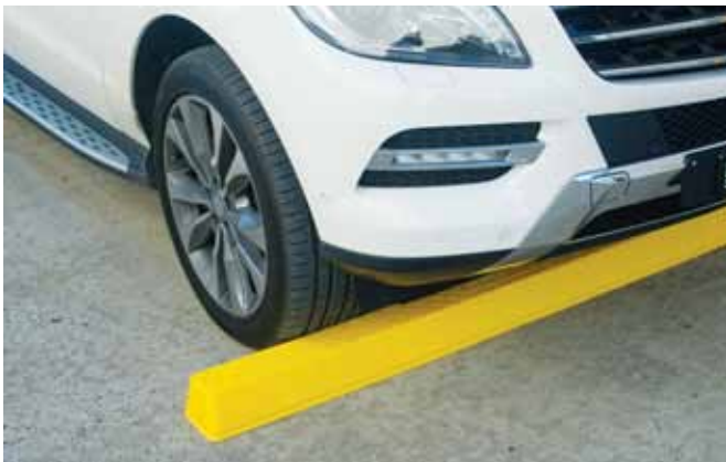
One piece construction with incredible strength & flexibility.

Designed to comply with AS2890.1:2004 and manufactured from high-tech Linear Low Density Polyethylene (LLDPE) with sustainability in mind, the Compliance One Piece Wheel Stop has emerged as a winner!