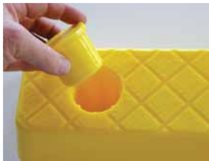
Safety Yellow for clarity of vision.