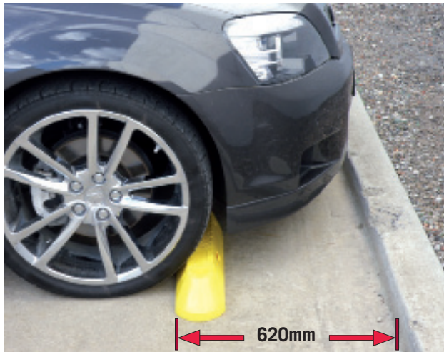
Front into a low kerb.