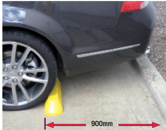
Rear into a low kerb.