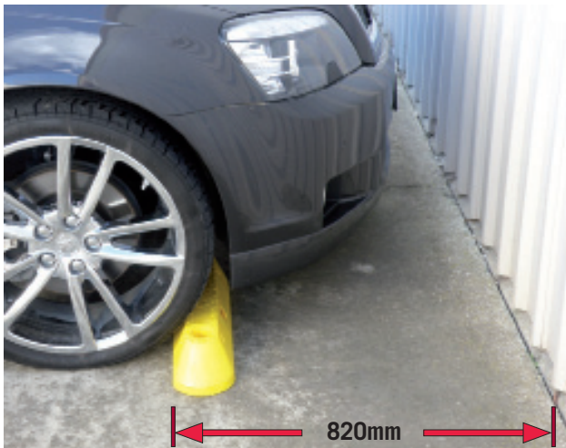
Front into a high kerb or wall.