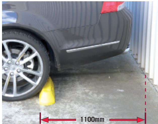
Rear into a high kerb or wall.

Wheel stops may be provided where it is considered necessary to limit the travel of a vehicle into a parking space.